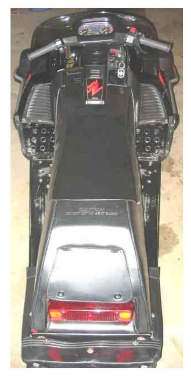
This sled is too nice to just part out... Buy it, Fix it, Ride it, Enjoy it

02325 The power of protection from AOL and eBay. Learn more