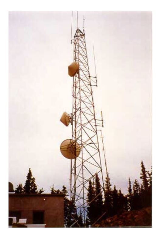
SQUAW MOUNTAIN REPEATER SITE / AIR NET AND AIR GUARD BASE RADIOS