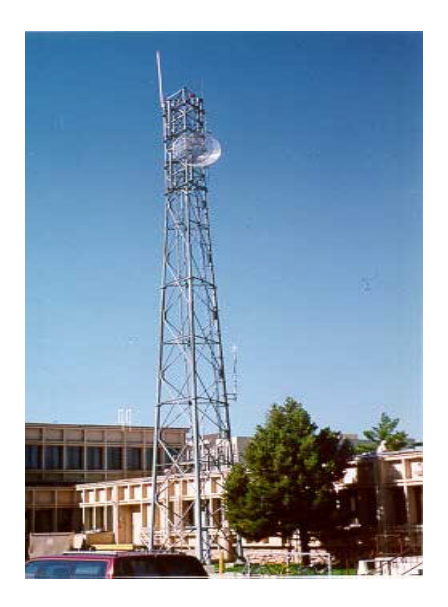
FORT COLLINS DISPATCH CENTER TOWER