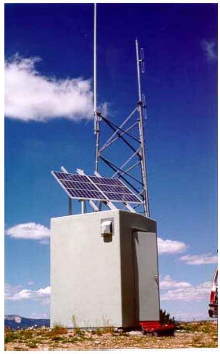
MINES PEAK REPEATER SITE / SOUTH COTTONWOOD REPEATER SITE