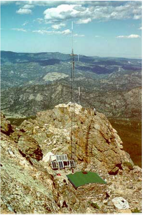
DEADMAN REPEATER SITE AND LOOKOUT TOWER TWIN SISTERS REPEATER SITE, FORMER LOOKOUT TOWER LOCATION.