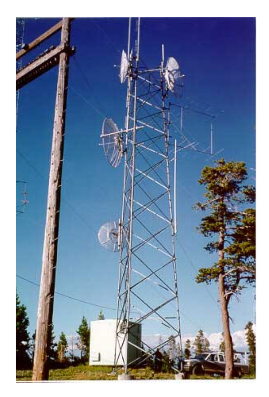
BLUE RIDGE REPEATER SITE