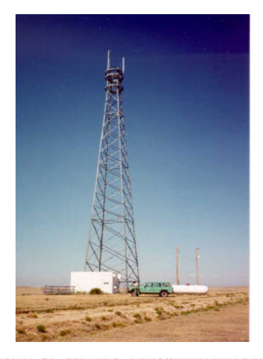
PAWNEE NATIONAL GRASSLANDS - RENO/SEVEN HILLS REPEATER SITE.