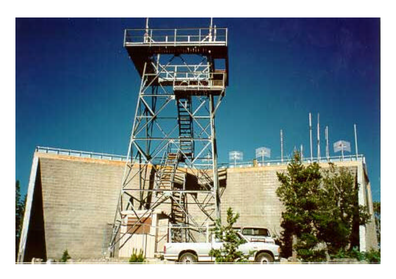
THORODIN REPEATER AND TELECOM SITE, OLD LOOKOUT TOWER WAS REMOVED IN 1995.