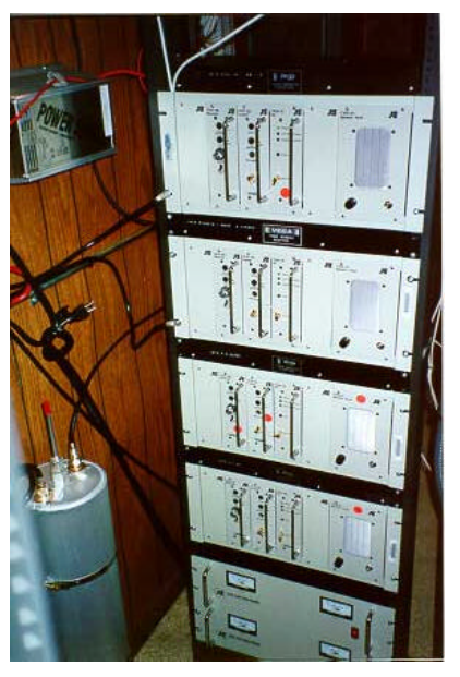
BUCKHORN REPEATER AND BATTERY POWER SYSTEM.BASE RADIO INSTALLATIONS AT BUCKHORN MOUNTAIN (ROOSEVELT NET, AIR NET, AIR GUARD).