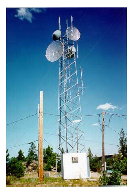
BUCKHORN MOUNTAIN PRIMARY INSTALLATION