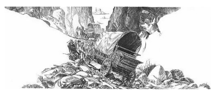
Mormon pioneers descend the hole they had blasted into the rock.

The "short-cut" proved to be deceptive, and the pioneers spent the winter at Forty-Mile Spring. A portion of the group camped at the top of the Hole-in-the-Rock, a narrow crack in the canyon rim 2.5 miles (4 km) downstream from the mouth of the Escalante River. It was through this notch that the party intended to make its way. Throughout the winter, they worked on the crack, enlarging the opening.